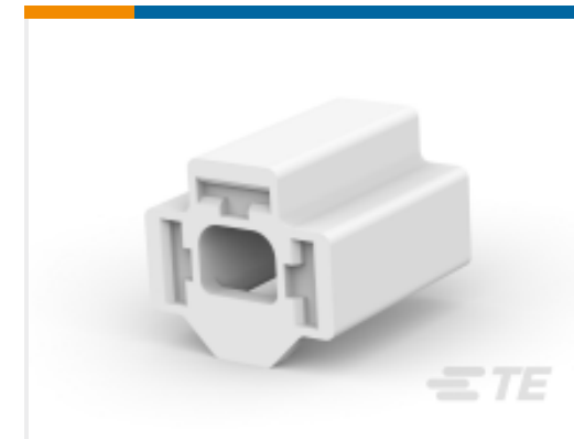
TE Part # 925306-2 FF 312 REC HSG 3P NYLON CLEAR